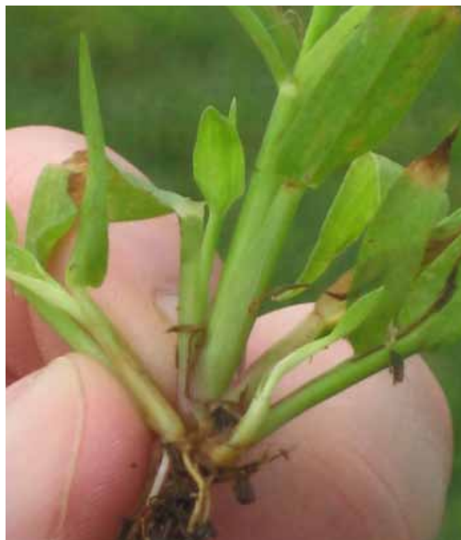
Figure 2. Smooth crabgrass ( Digitaria ischaemum )