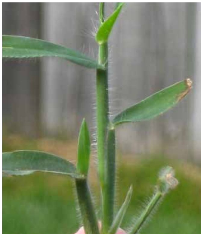
Figure 1. Large crabgrass ( Digitaria sanguinalis )

differentiated by examining the leaves and stems of each species. Large crabgrass has pubescence (hairs) on its leaves and stems, while the leaves and stems of smooth crabgrass have very little pubescence except on the collar region (the intersection of the leaf and stem of the plant). Smooth crabgrass is the most prevalent crabgrass species infesting turf in Tennessee. Both large and smooth crabgrass are summer annuals that germinate primarily in the spring, grow through the summer, produce seeds in the fall and die following the first killing frost.