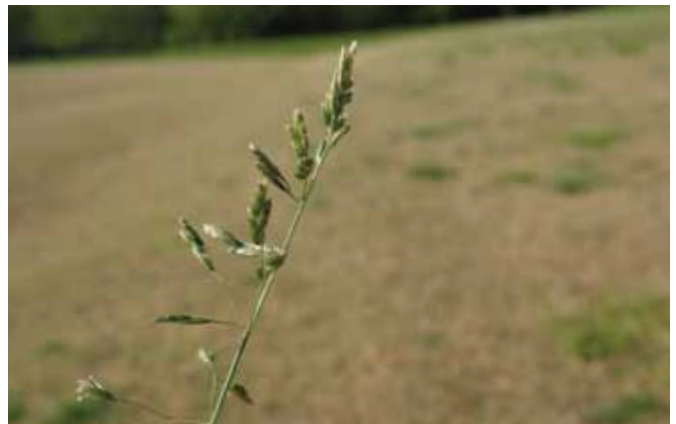
Figure 4. Annual bluegrass ( Poa annua ) seedhead

field with a cool-season turfgrass species (unless otherwise stated on the label).