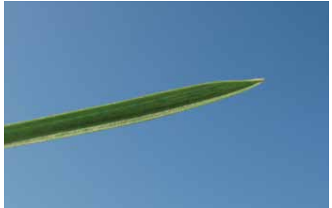
Figure 3. Annual bluegrass ( Poa annua ) leaf blade