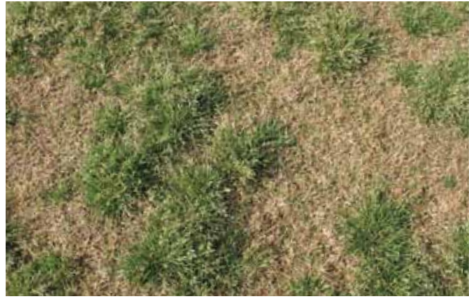
Figure 2. Annual bluegrass ( Poa annua )

Numerous preemergence herbicides are available for annual bluegrass control (Table 1). In Tennessee, annual bluegrass generally begins to germinate in early September. Keep in mind that preemergence herbicides act by preventing germinating seedlings from developing into mature plants. These herbicides must be applied prior to seed germination. For preemergence control of annual bluegrass, target applications for late August. Preemergence herbicides should not be applied if there is any consideration of overseeding the